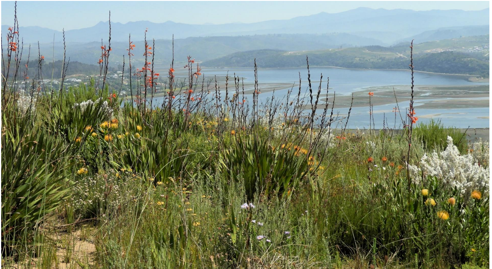
Beautiful fynbos plants overlook Knysna lagoon