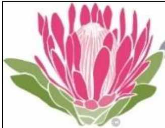
TABLE MOUNTAIN FUND